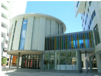
Object Gallery, St Margarets, Surry Hills, Sydney