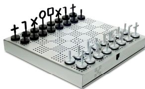
Stuart McFarlane, Chess , 2006, anodised aluminium.